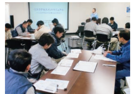
Risk assessment training